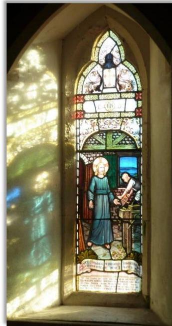
Christ in the Carpenter's Workshop