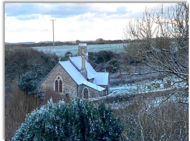
St Madoc’s in the snow

A variety of ideas were suggested: a practice space for ukulele players as well as a link to the local school; a small exhibition space; photography and music; a festival to coincide with those of Little and Broad Haven; a location for film shoots and exploiting the link with the Woodland Walk; various craft workshops and coffee mornings were also suggested.