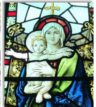
St Mary and Child