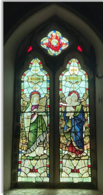
St Mary and St Cecilia window

heart. Consequently, she became the Patron Saint of Musicians.