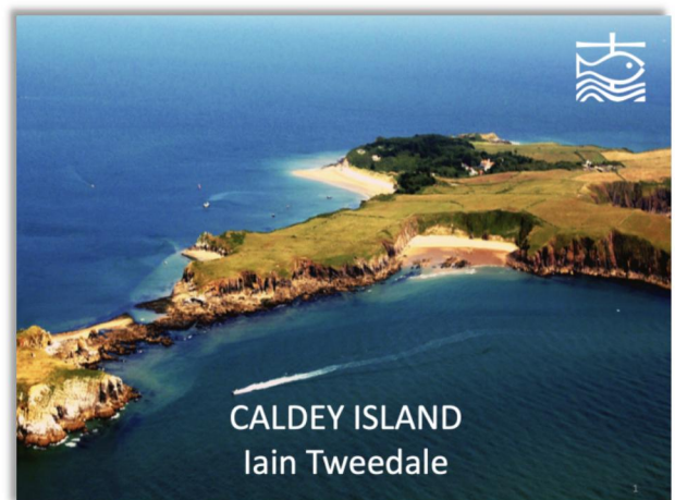
Iain Tweedale - 'Life on Caldey' talk at the AGM