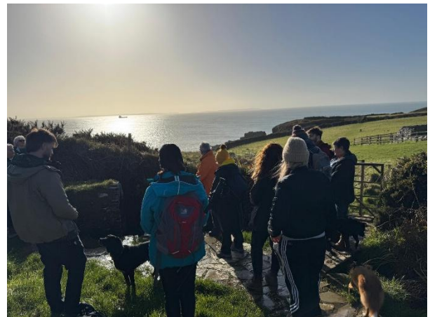
Pilgrims enjoying the view at St Non's Well

us with decision making when we have a lease. We'll be putting these up on our website in due course and would appreciate your feedback on them. We have also submitted our annual report to the Charity Commission.