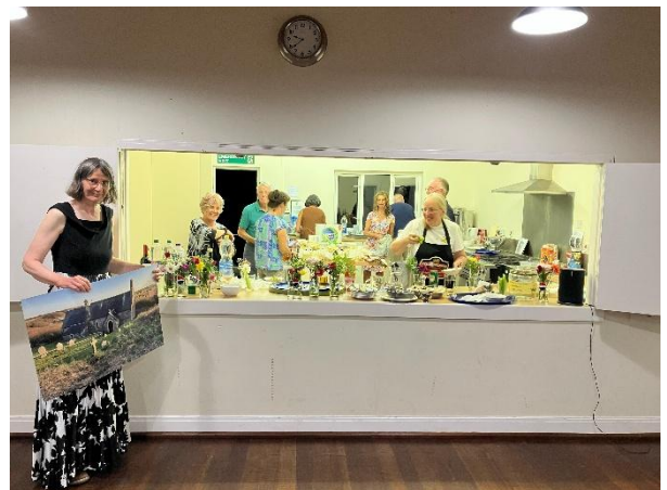
Some of our volunteers helping at the cheese and wine evening